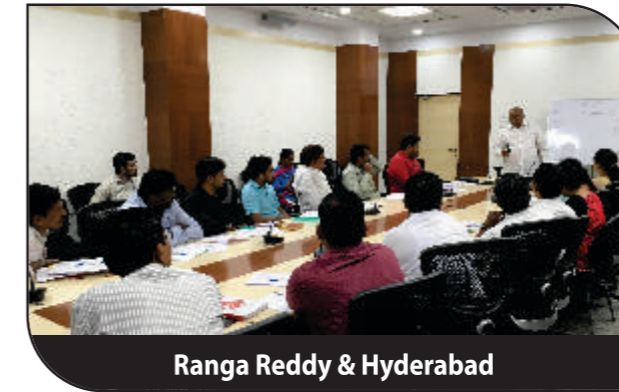
Ranga Reddy & Hyderabad