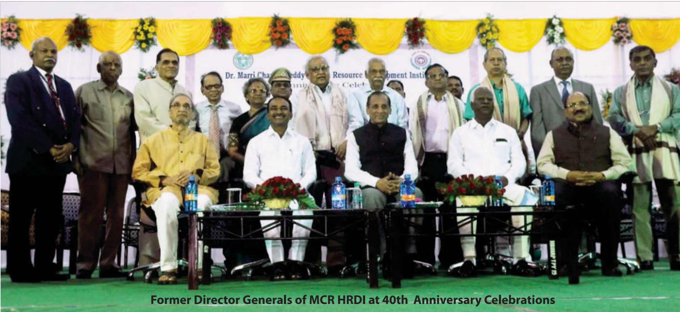
Former Director Generals of MCR HRDI at 40th Anniversary Celebrations