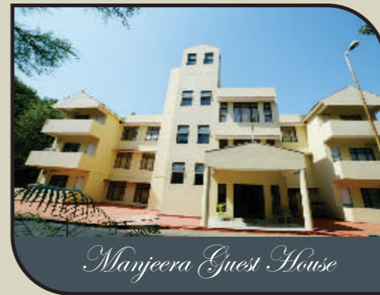
Manjeera Guest House