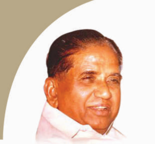
Dr. Marri Channa Reddy Chief Minister of Andhra Pradesh (1978 to 1980 and 1989 to 1990) The Institution is named after him

In 1988, the Institute shifted to its present premises, in Jubilee Hills, spread over 30 acres. Classes were continued to be offered at BRKR Buildings and ShakkarBhavan till 1992 since the infrastructure works were in progress.