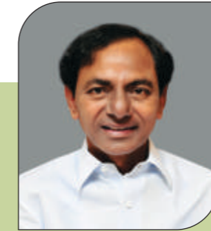
K. CHANDRASHEKAR RAO Chief Minister Telangana State

To strive towards sustainable excellence in sharing constantly updated knowledge and skills with the personnel serving the government and to promote capacity building and competencies among them