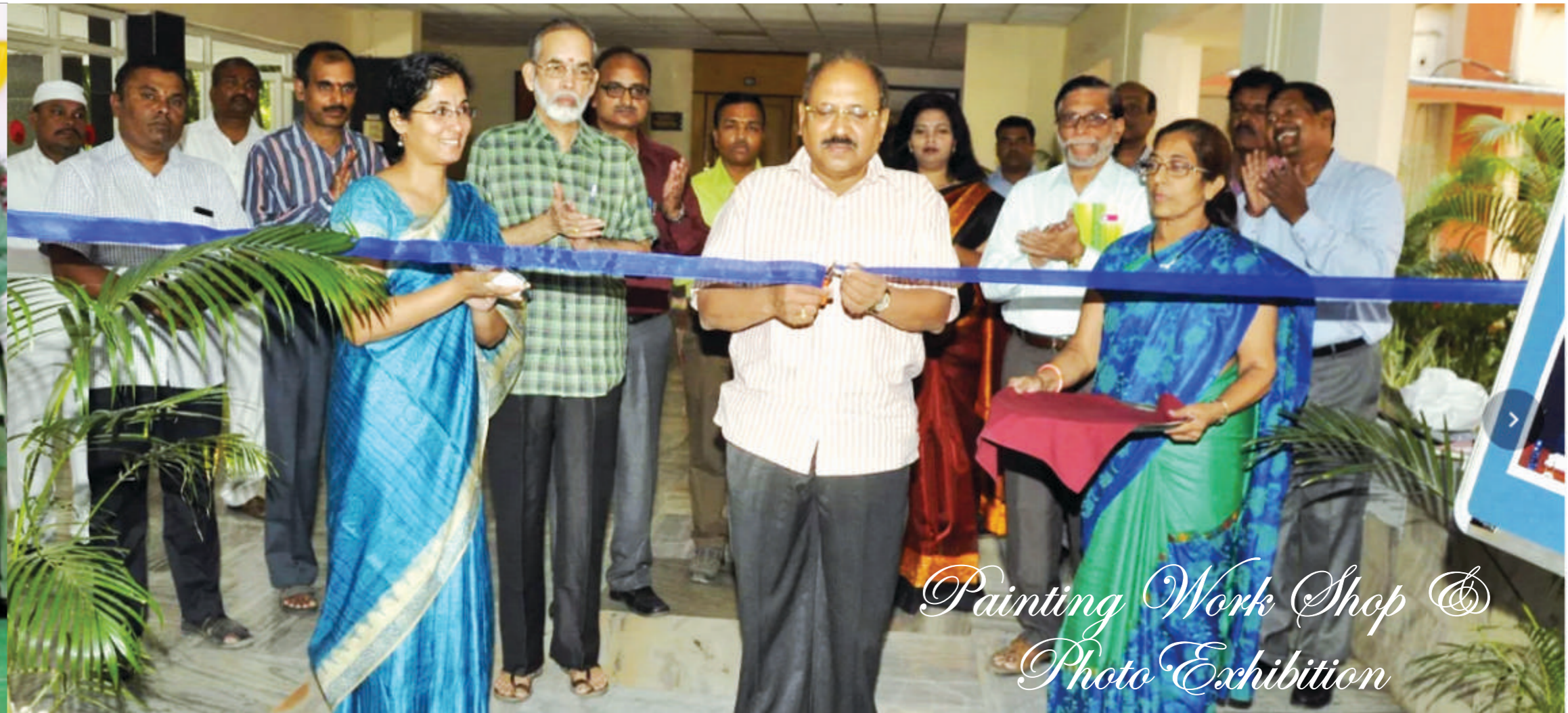
Painting Work Shop & Photo Exhibition