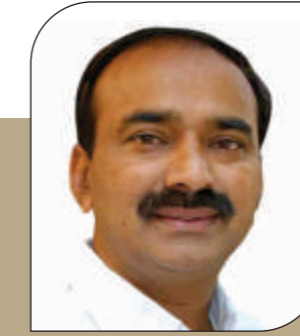
ETELA RAJENDER Finance Minister, Telangana State